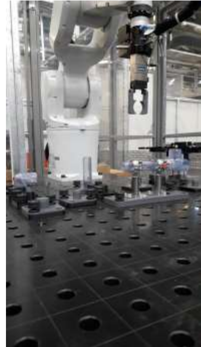
Proof of Concept